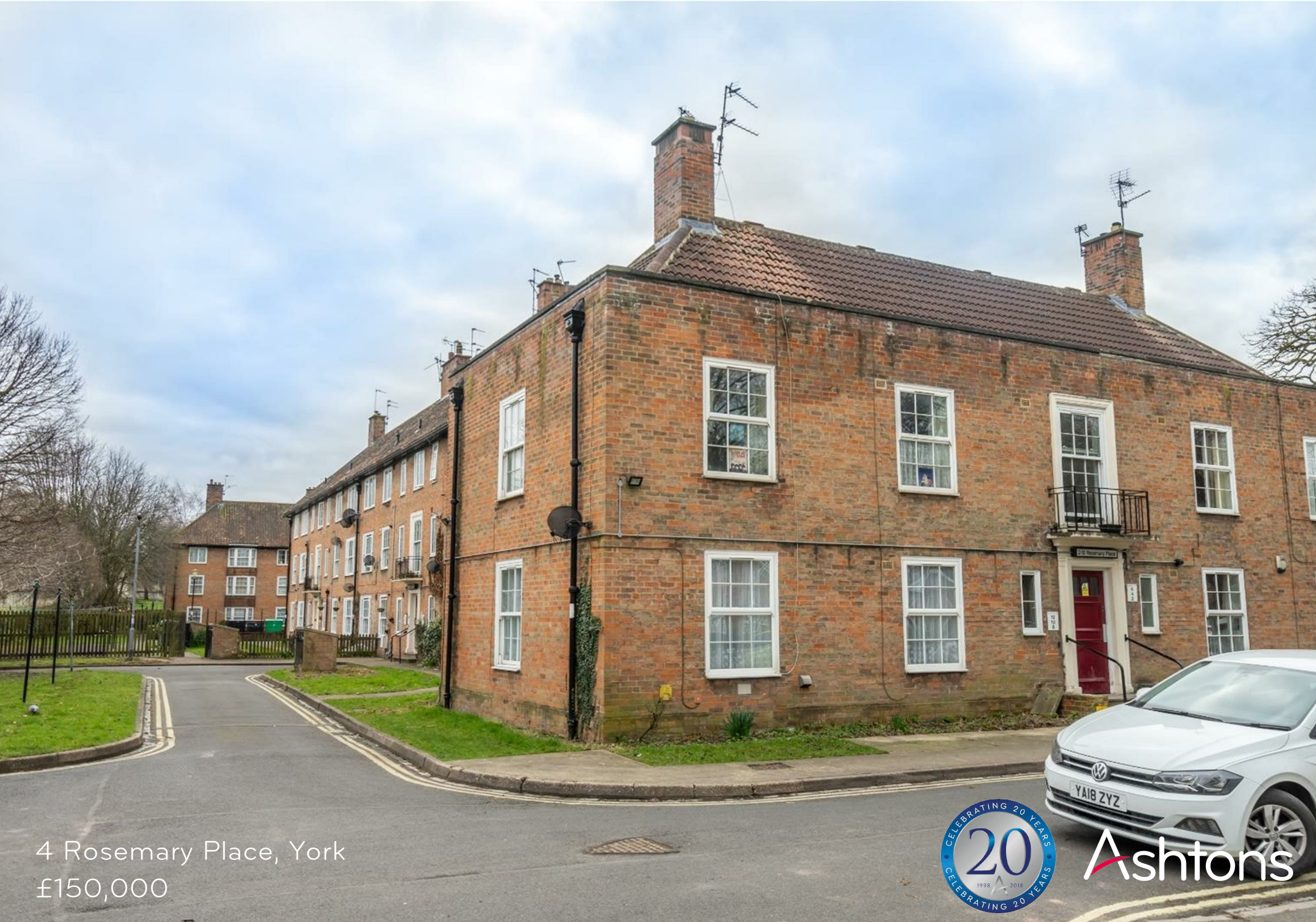
4 Rosemary Place, York £150,000